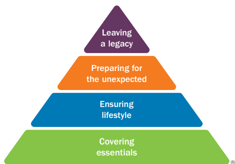
Confident Retirement ® approach

One of a series of papers on the Confident Retirement ® approach