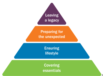
Confident Retirement ® approach

If you're five or more years away from retirement, achieving financial confidence typically means finding the right balance between today's needs and desires and tomorrow's goals and dreams. It's about making choices in order to live a life on your terms beginning now and for years to come.